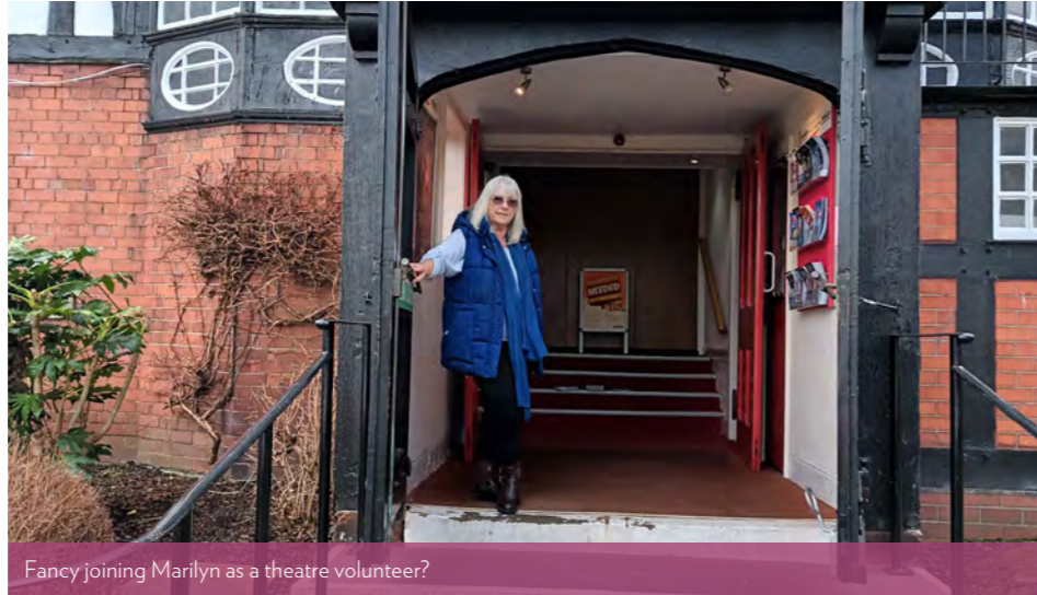
Fancy joining Marilyn as a theatre volunteer?

To enquire about volunteering at the Gladstone Theatre, drop in to the theatre on Greendale Road on weekdays or call 0151 643 9223.